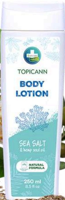
packaging: 250 ml